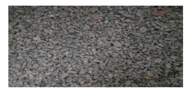
Fig.5. Course Aggregate

These are the crushed stones size ranging from 4.5mm to 20mm the aggregates used were as per IS: 383.