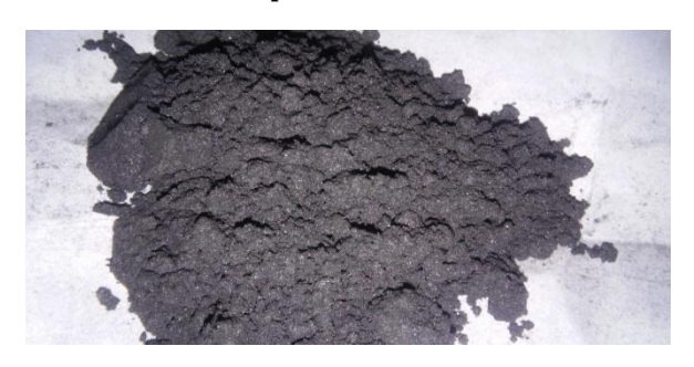
Fig: 2 Reduced Graphene Oxide

Reduced Graphene Oxide is a material which has high surface to volume ratio. The reduced graphene oxide was purchased from United Nano Tech limited. The features of RGO are as given in the table.