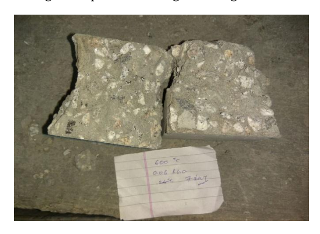
Fig.9 Specimen after failure

The compressive strength of all concrete specimens was determined following Indian Standards procedure. The specimens were removed after 24 hours from the moulds and then immersed in water until their respective testing period. For each test three specimens were tested for the determined the average compressive strength. Test was performed on compressive testing machine having capacity of 1000 MT. the average values of samples has been reported below.