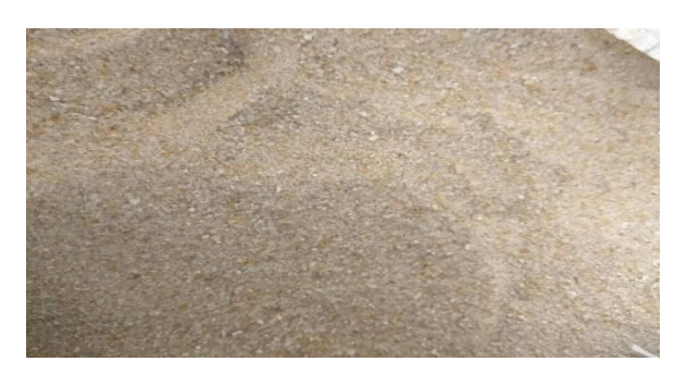
Fig. 6. Fine Aggregate

These aggregates vary from size 150micron to 4.5mm as per IS: 383. This was brought from Cauvery River and screening was done to remove oversize aggregates.