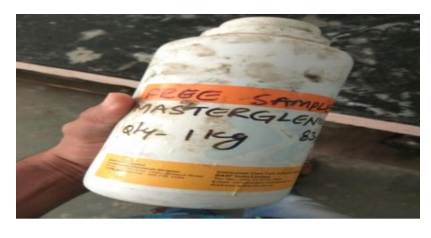
Fig.4 Masterglenium Sky 8341

The chemical used as a super plasticizer was masterglenium sky 8341. This was provided free from BASF Bengaluru. This was used 0.5% as to increase the workability of the concrete.