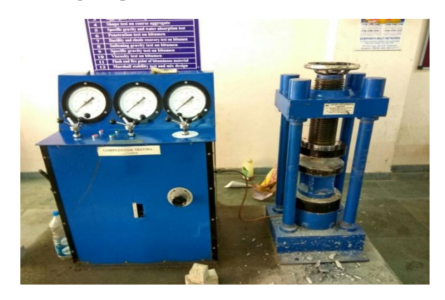
Fig.8 Compressive Strength Testing Machine