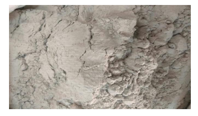
Fig: 1 Ordinary Portland cement

In this experiment we have used Ordinary Portland Cement of grade 43 (Ultra tech Cement) with IS: 8112-1989. The cement was in light grey colour with good chemical and physical characteristics.