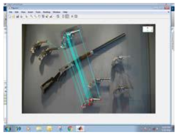
Fig. 10. Copy Move forgery and its implementation. (i)Original image, (j) Resultant Image