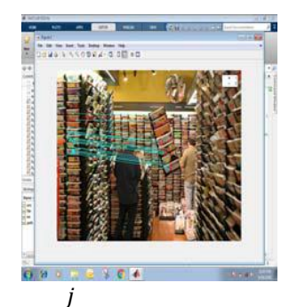
Fig.9. Copy Move forgery and its implementation. (i)Original image, (j) Resultant Image.