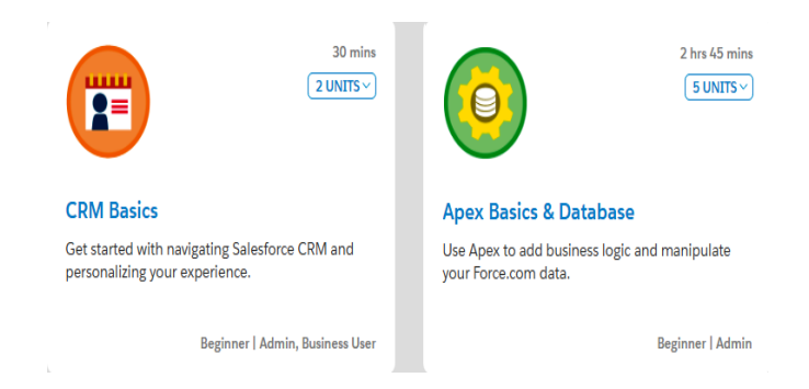
Fig 2: Trailhead Modules

Salesforce.com is providing Trailheads to learn the basic Application development concepts of salesforce.com platform. According to user requirements, Salesforce.com has number of trailhead modules. These modules are very useful for getting actual idea about our product development work flow. Each module of trailhead contains the enough information for understand the development process in salesforce.com.