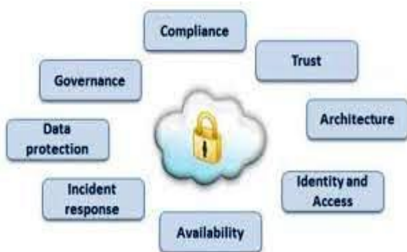
Fig.1: Security Problems in Cloud Computing Environment