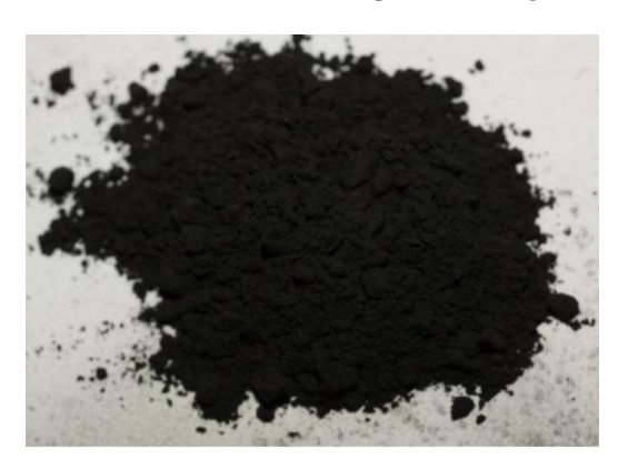
Fig -1: Copper oxide (CuO) in form of nano powder

MoS2 and CuO nanoparticles, as shown in Figure 1 and 2 are purchased from Mahavir Sales Corp, Ahmednagar.