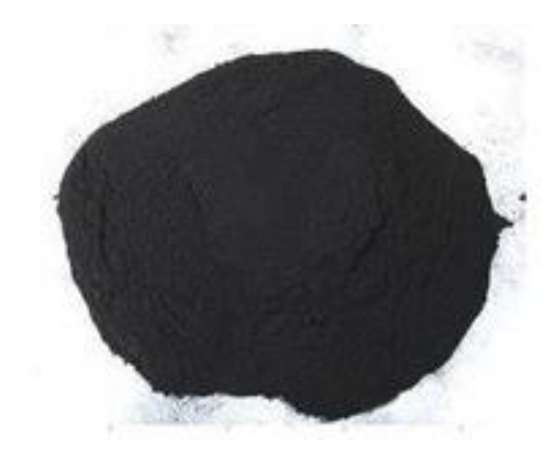
Fig -2: Molybdenum disulphide (MoS<sub>2</sub>) in form of nano powder