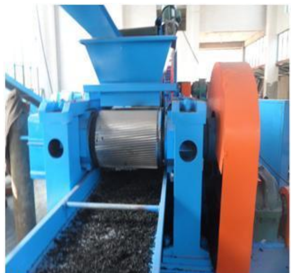
Fig.No.-1 Rubber Cutting Mchine

Based on the results of the experimental investigations conducted on normal and crumb rubber modified asphalt mixes, the following conclusions can be drawn. The results indicate that the increase in stiffness is 72% and 79% for the base bitumen at both temperatures of 20°C and 40°C, respectively. The crumb rubber modified bitumen shows an increase of 21 % and that the effect of aging is small in the modified mixtures as compared to normal binders. Thus, modified mixes are expected to yield longer lives due to better ageing. The data of creep stiffness indicate the unaged samples CRI1 mixtures with an improved 56% increase, while the increase of 16% and PMA-D showed an improvement of 63% of control mix at 40°C.