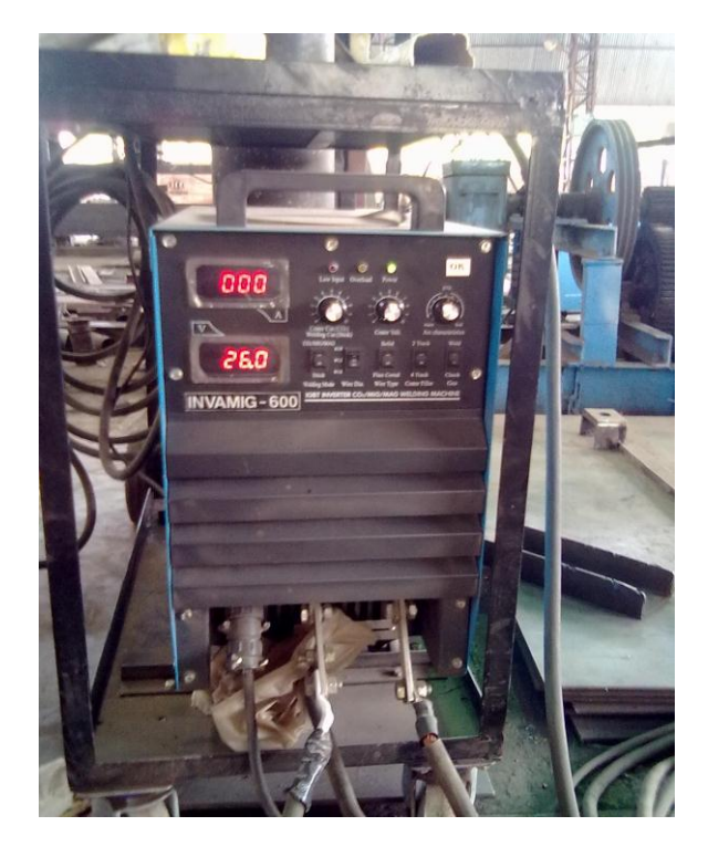
Figure No. 1

welding voltage (V), welding current (A). The output quality characteristic was dilution. All these parameters were investigated on 3 levels. The welding input variables and their limits are given Table 3. For avoiding systematic errors further in carrying out the experiments, 09 experiments were randomized for placing bead-on-plate welds on the ST-37 steel rod. The experimental layout for the welding process parameters using L09 orthogonal array and the experimental results for the weld bead dilution are shown in Table 4