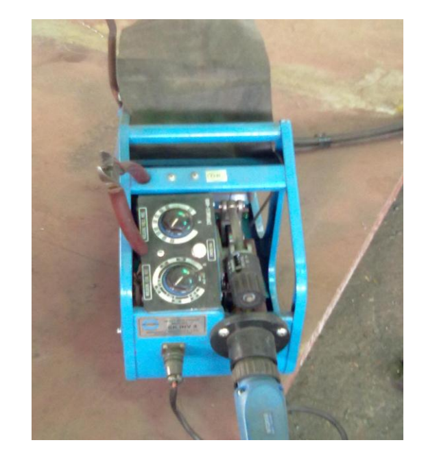
Figure No. 2