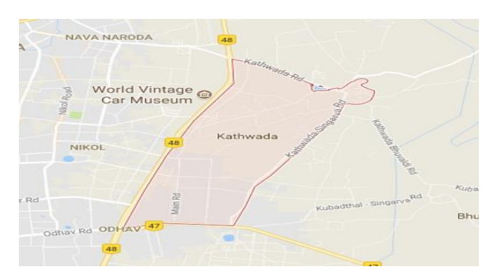
Fig 3: Location map of Kathwada

Also one is located near the city center and the other is located far from the city center.