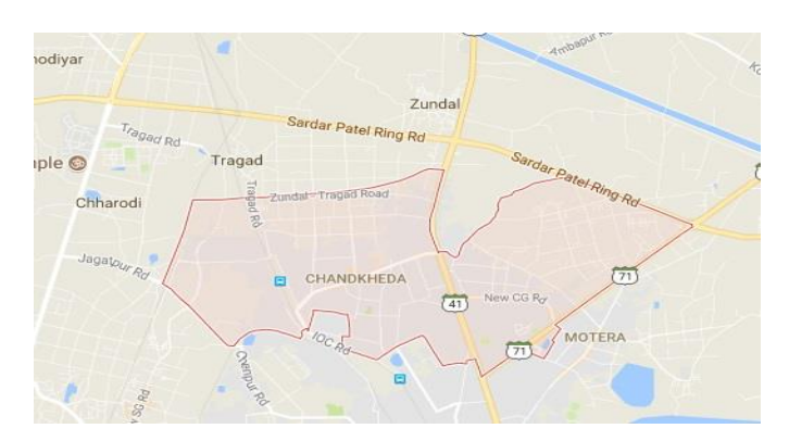
Figure 2: Location map of Chandkheda

In addition the study of this research is limited to selecting only two neighborhood area. These two neighborhoods are compared and verified with the indicators of the sustainable transportation system. These two neighborhoods are Chandkheda and Kathwada, which are located at the edge of the city of Ahmedabad.