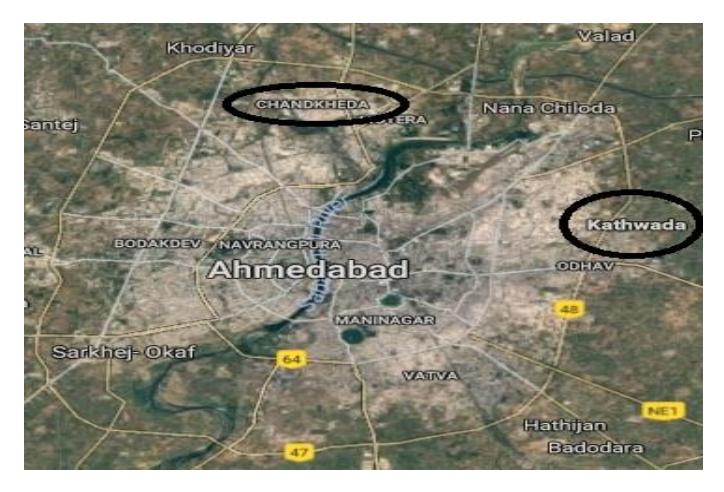
Figure 4: location map of neighbourhood

The population of Kathwada is 23,300 and contains the area of 7.25 sq. km. The density of Kathwada area is 3,217/km sq. It contains the household of 4,940.