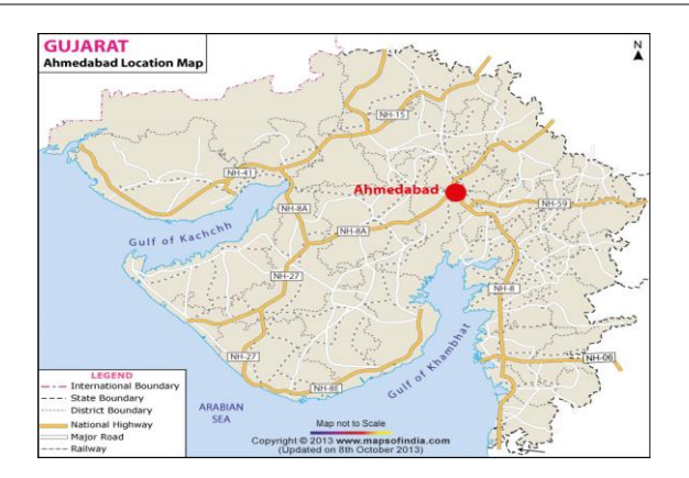
Fig -1: Location of Ahmedabad City

Volume: 05 Issue: 01 | Jan-2018 www.irjet.net p-ISSN: 2395-0072