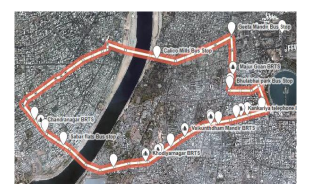
Fig -2: Study area

The study area includes the highlighted portion in the map of ahmedabad as shown in above fig. This study area includes some of the major transport station which are used by all type of employers in ahmedabad city to reach their work destinations. The study area having major slums land use characteristics of particular city as shown in below map.