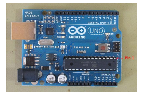
Figure 3 Arduino microcontroller

Immutability and individuality or uniqueness. contrast, a switched-mode power supply regulates either output voltage or current by switching ideal storage elements, like inductors and capacitors, into and out of different electrical configurations, Ideal switching elements.