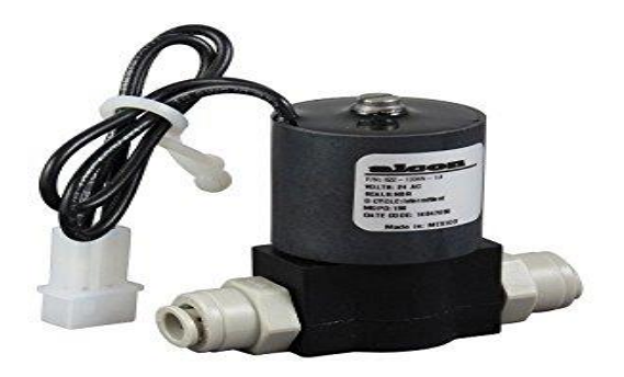
Figure 1 Electronic solenoid valve

The main objective of using electronic solenoid valve is to control the fuel and to avoid theft of fuel in case of off condition. In this paper, there will be flow of fuel only during the ON state of the vehicle. Which needs a fingerprint recognition to start and this electronic solenoid valve works only when a fingerprint is recognized.