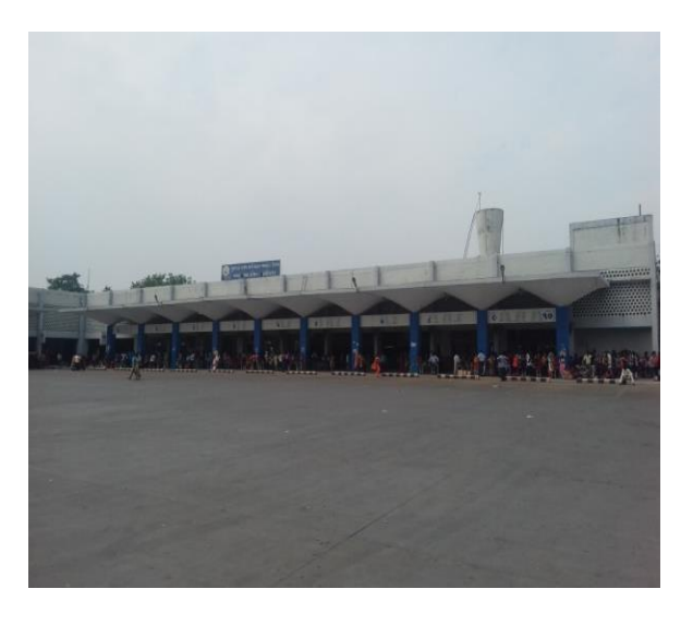
Figure -5: Actual image