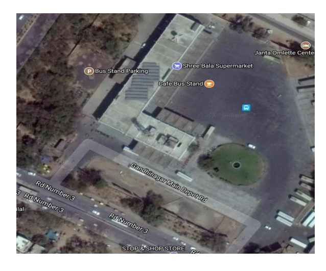
Figure -3.2: Satellite view