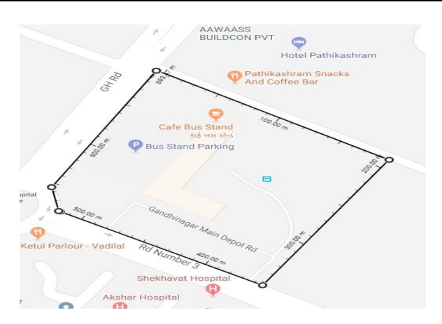
Figure -3.1: Gandhinagar Bus Station