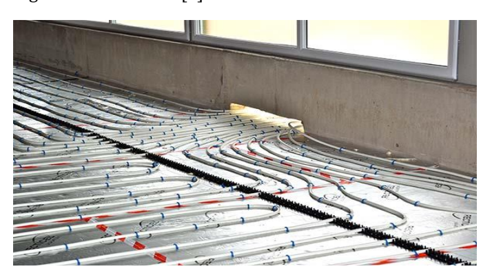
Fig 4-Under Floor Heating[9]