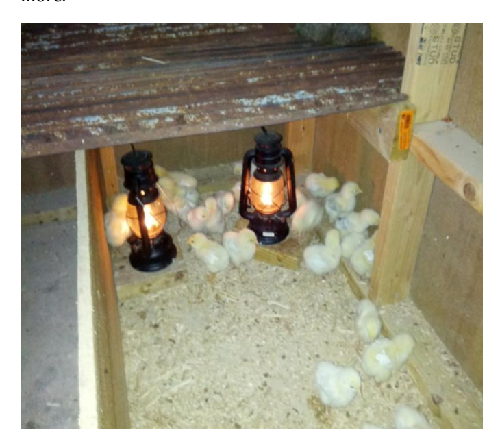
Fig6- Kerosene Brooder[12]

It creates health issue for chicken. Also availability of Kerosene may create problem. Requirement of cost is more.