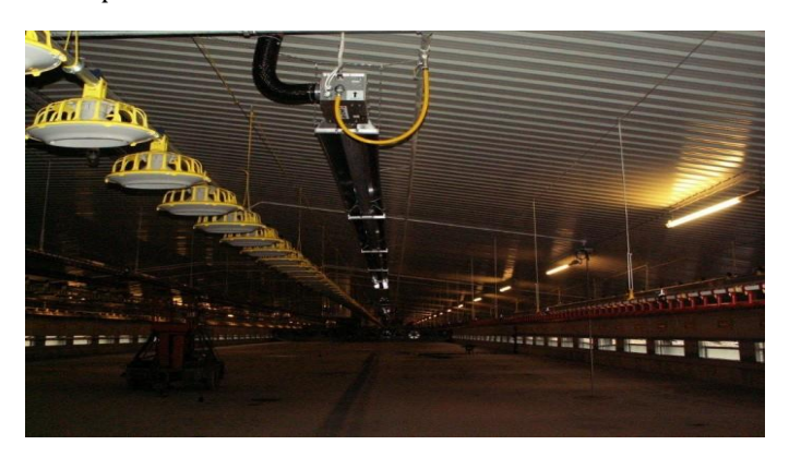
Fig 2- Radient Tube Heater[5]

Disadvantages are Overheating can occur. Temperature variation along tube length. Discontinuous power supply can cause problem.