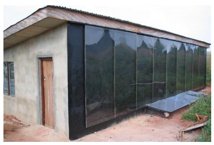
Fig 5- Tromb Wall Poultry Chick Brooder[11]

Trombe wall form an integrated part of the house duly oriented south ward for maximum solar energy collection all year around this is made of 0.22 m thick solid block to form the thermal storage system external surface of wall which is expose to environment is treated with black paint for the absorption of radiation energy from sun. Glazing through the glass reduce excess heat loss from long wave radiation.[10]