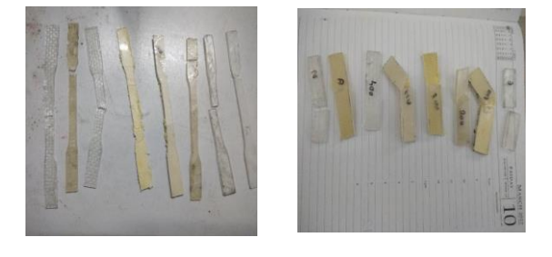
Fig 1.6 Tested Laminates

In here ANG 200 and 400 GSM HFRC laminates gives a worthy results and also, even if it had a failure at the time of load carrying the strength is quickly reduced but after at some point level it has gain as shown in the figure