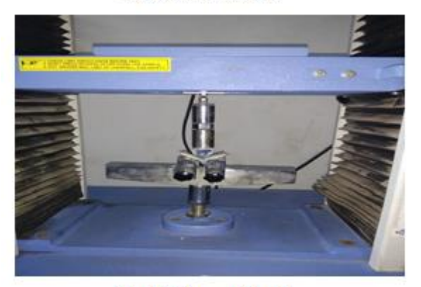
Fig 1.5 Flexural test

By the blend of aramid and nylon HFRP composite not give a normal outcome as a result of holding issues. So by getting ready glass filaments like 200 and 400 GSM overlays with aramid and nylon textures give a superior come about by looking at different composites. The main concept of Strain hardening is the process of making the material to harden after deformation and to increasing stress on a material.