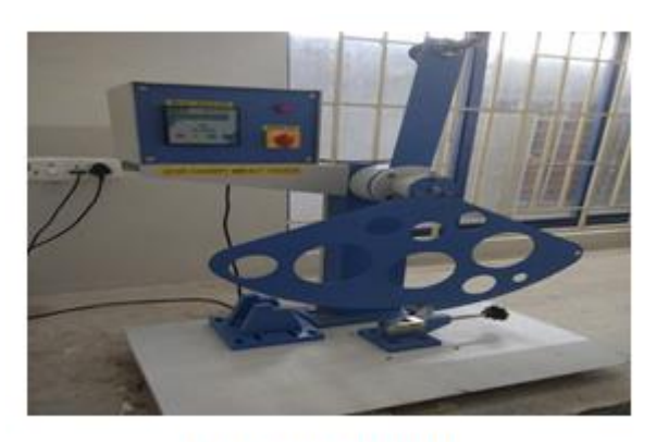
Fig 1.4 Impact test

The outcomes were depicted aramid fiber is great in quality however not great in prolongation. For this situation Nylon strands gives a decent outcome in stretching yet not all that well in quality.