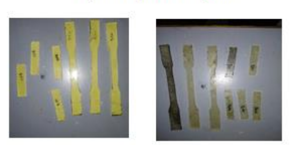
Fig 1.2 ASTM standard laminates