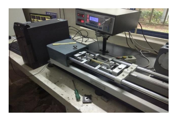
Fig 1.3 Tensile test

The tensile, flexural and impact strength of polymer composite was tested by using the Strain controlled UTM based on ASTM standards shown in figure. The size of 165mm X 19mm X 13mm for tensile, 50mm X 13mm for impact and 50mm X 13mm flexure (as per ASTM standard size).