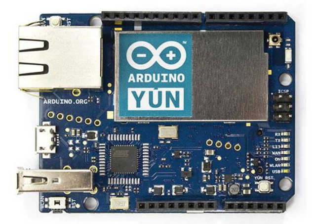
Fig -1: Arduino Yun Board