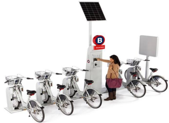
Fig -1: Proposed system

Key Words: Bicycle Sharing system, Dock, Smart phone, GPS.