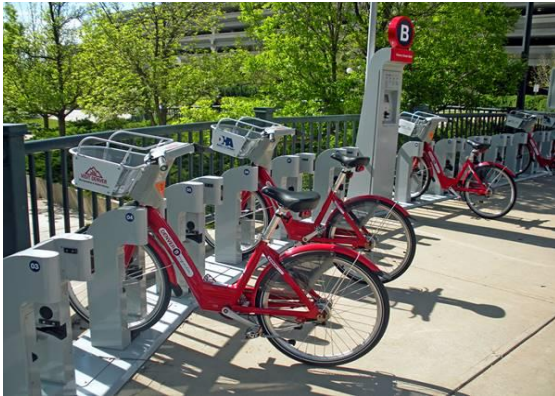
Fig -3: Implementation of project

GPS tracking software. Data tracking software is available for smartphones with GPS capability.