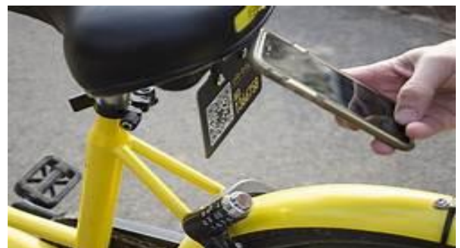
Fig -6: Name of the figure

This app helps cyclist to know nearest parking slot and also will show the time consumed and also the required details for the payment as well. Mobile application are created to make the user experience more efficient and useful.