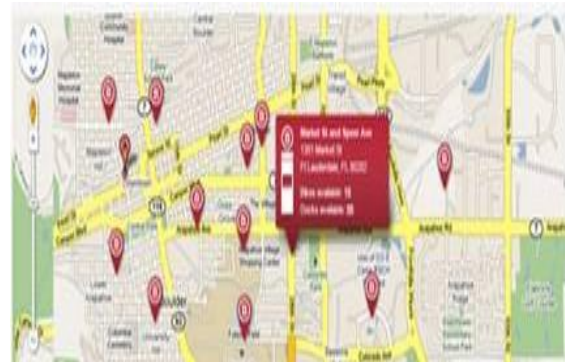
Fig -4: GPS tracker

GPS tracking software. Data tracking software is available for smartphones with GPS capability.