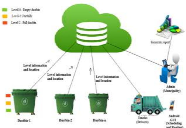
Fig 2: System Architecture

To design system for waste collector which will show the information about level of waste in waste collector to user and on android application and also show the all available waste collector in nearby area and path to nearest waste collector.