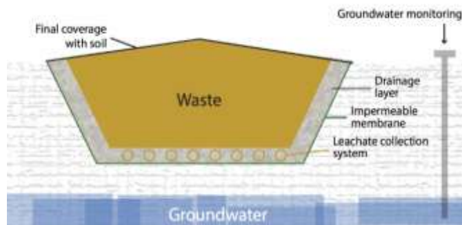
Fig-1: Schematic representation of a landfill

Waste disposal has become one of the most serious modern environmental problems in developed and developing countries all over the world. The open dumps create several environmental pollutions. One of the preferred methods of dealing with this kind of environmental problem is to dispose off the waste in sanitary landfills. Landfills are highly engineered waste containment facilities, designed to minimize the impact of solid waste on the environment and human health. Landfills are the most popular and important method for disposing solid waste due to their simplicity, low exploitation and low capital costs.