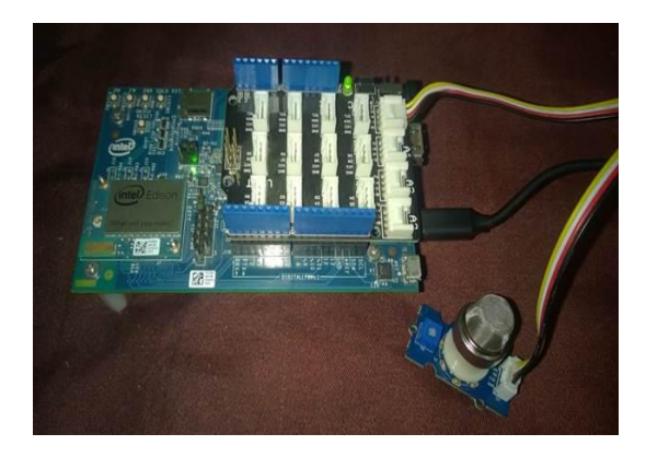
Fig 4.3 Intel Galileo connected to gas Sensor

International Research Journal of Engineering and Technology (IRJET)e-ISSN: 2395-0056Volume: 05 Issue: 02 | Feb-2018www.irjet.netp-ISSN: 2395-0072