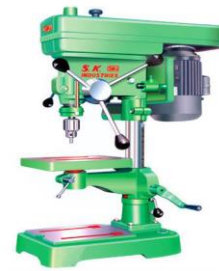
Fig.1.4.2 Drilling machine

Drilling is a process of producing circular holes in a rigid body or material or enlarging existing holes with the use of multi tooth cutting tools called drills or drill bits.