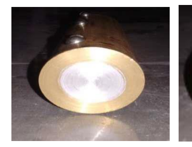
Brass + Al