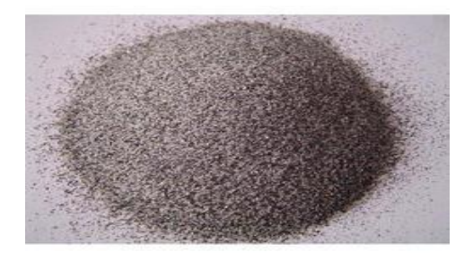
Fig -2: M-Sand

Barmac Sand, Pozzolan Sand etc. IS 383-1970 (Reaffirmed 2007) recognizes manufacture Sand as 'Crushed Stone Sand'. M-Sand can also be used for making masonry Mortar and shall conform to the requirements of IS 2116-1980 (Reaffirmed 1998) – "Specification of Sand for Masonry Mortars". In this project Karur crushed blue metal M-Sand was used.