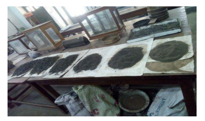
Figure 1 Gradation of aggregate sample

Table -2 : Gradation of stone Aggregate for SDBC as per MORTH Specification (Table 500-15)[2]