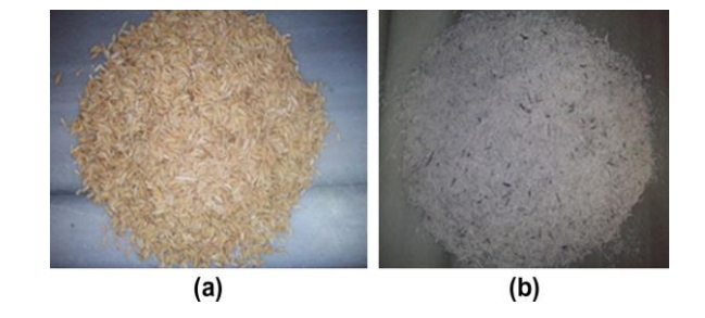
Figure 4. (a) Raw RH & (b) Burnt RHA

As per MORTH [2] Specification (Sec 505.2.4) Filler shall consist of finely divided mineral matter such as rock dust, hydrated lime or cement approved by the Engineer. The use of RHA should be encouraged because of its very good antistripping and antioxidant properties.