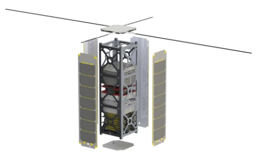
Fig-1: 3U CubeSat [4]

on the mission objective, there are usually several levels of embedded hardware with different power consumption.