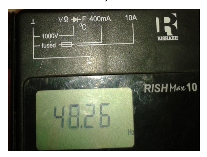
Fig -1: Name of the figure

Frequency of the output power can be measured either by multimeter or by CRO (scope). At the end of experiments, finally we get a frequency of 48.26Hz for some constant time period as shown in figure and sometimes it touches to exactly 50Hz.