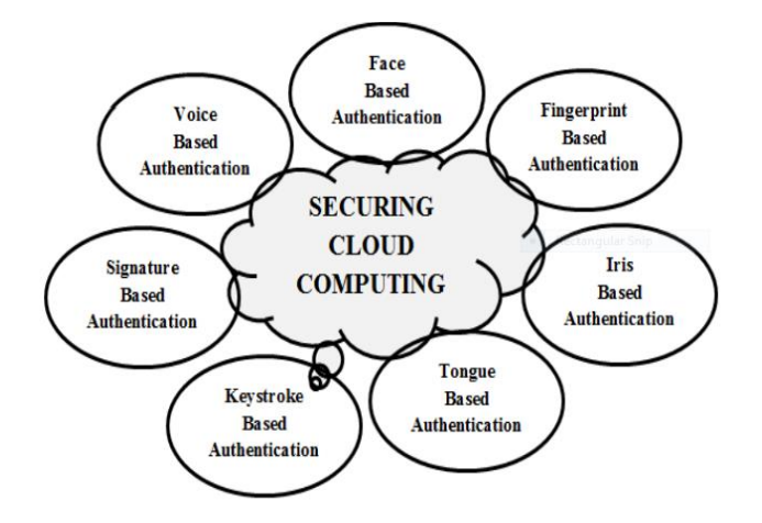
Figure 1 Biometric Techniques to Secure Cloud Computing

For providing security to cloud, we can use different techniques. Generally passwords are used for authentication. But passwords are easily attackable. This is cheapest as well as simplest technology. So we can use biometric authentication to provide security for cloud computing. Biometric authentication techniques, which are used for securing cloud computing as shown in the Fig. 1