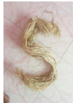
Fig -1: Pineapple Leaf Fiber

technologies include enzymes, surfactants, synthetic polymers, biopolymers, co-polymer based products, cross-linking styrene acrylic polymers, tree resins, ionic stabilizers, fiber reinforcement, calcite, calcium chloride, sodium chloride, magnesium chloride and more. However, recent technology has increased the number of traditional additives used for soil stabilization purposes. Such non-traditional stabilizers include: Polymer based products (e.g. cross-linking water-based styrene acrylic polymers that significantly improves the tensile strength and bearing capacity of treated soils), Copolymer Based Products, fiber reinforcement, Sodium Chloride and calcium chloride.