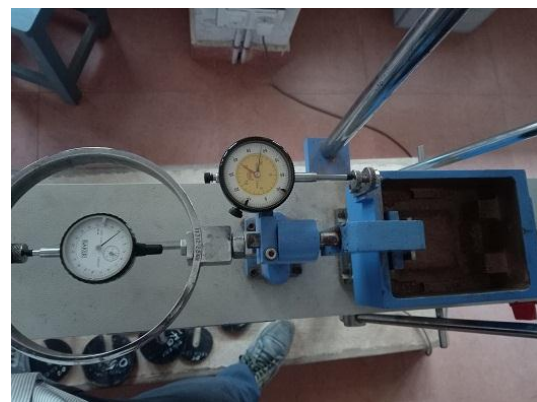
Fig -3: Direct shear apparatus

Change in value of shear strength of soil on addition of different percentage of fibre content is illustrated in Table-2.