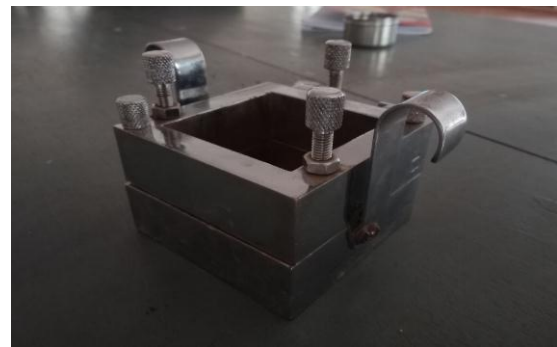
Fig -2: Direct shear mould

foundations, and calculating the pressure exerted by a soil on a retaining wall. In this test , a direct shear device is used to determine the shear strength of a soil. From the plot of the shear stress versus the horizontal displacement, the maximum shear stress is obtained for a specific vertical confining stress. After running the experiment for several times for various vertical-confining stresses, a plot of the maximum shear stresses versus the vertical (normal) confining stresses for each of the tests is produced. From the plot, a straight-line approximation of the Mohr-Coulomb failure envelope curve can be drawn and thus f may be determined. Here change in the value of cohesion c and angle of internal friction f denotes the change in shear strength of soil .