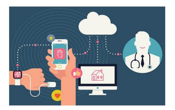
Fig -1: IOT in healthcare system