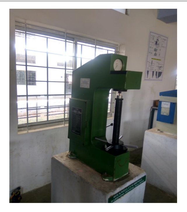
Figure 2: Brinell hardness testing apparatus