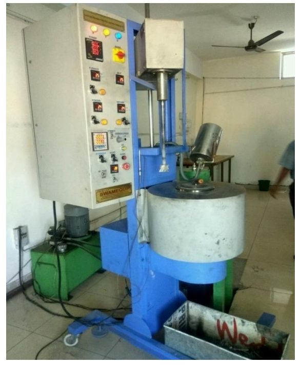
Figure 1: Aluminium stir casting setup

The Aluminium Al6061 matrix composites were fabricated by mixing the accurately weighed quantities of welding slag electrode E6013 and MIG welding flux (MgO) The above mixture was slowly added, and stirred. Stirring was carried at 650rpm about 50 seconds until interface between the particle and the matrix promoted wetting and the particles were uniformly dispersed. Melt formed was solidified in a permanent mould to obtain the flat plate samples. The different compositions were cast as mentioned above by stir casting method. The Stir casting setup is shown in the figure 1.