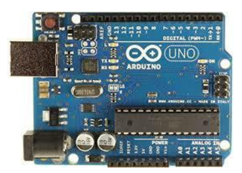
Fig-4: Arduino UNO

Atmega 328 is the foundation of Arduino UNO board. It is manufactured by Arduino. It is composed of twenty digital input or output pins. Six pins may be used for Pulse Width Modulation outputs and another six may be used as analog inputs. A power jack is provide along with a sixteen MHz resonator, in-circuit system programming (ICSP) header, a USB connection and a reset button for resetting operation. It has all devices which are needed to support the microcontroller. To get the microcontroller initiated, a USB cable is essential. The difference of Arduino UNO from all other boards it that others do not utilize the FTDI USBto-serial driver chip.