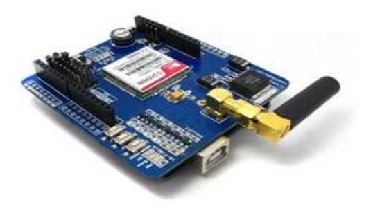
Fig-3: GSM Module

This system is comprises of GSM Module. The Micro controller is the heart of the device. It gathers the data of the current location which it is presented from the GPS system. It can make use of the data stored and can send location in form of latitude and longitude to the user. By this it can trace out the distance from the destination .The Arduino UNO microcontroller can be readily used with GSM Module. The cost efficacy of the GSM module makes it a perfect companion of the navigation system. The Global Positioning System (GPS) was an important invention in the United States of America that gives best positioning, navigation, and timing services to users on a complete worldwide basis which is available to all free of cost. For anyone with a GPS receiver, the system will provide location with time. GPS gives unambiguous location and time data for an unlimited number of people in all climates, day and night, anywhere in the world. The accurate timing provided by GPS facilitates everyday activities such as banking, mobile phone operations, and even the control of power grids. Surveyors, farmers, geologists and more others perform their work a little more precisely, economically, safely, and accurately using the free and abundant GPS signals. SIM808 module is a four Band GSM or GPRS module which is a combination of GPS technology for satellite navigation. SIM 808 is of utmost importance in this unit. It is acting like a GPS in this system.