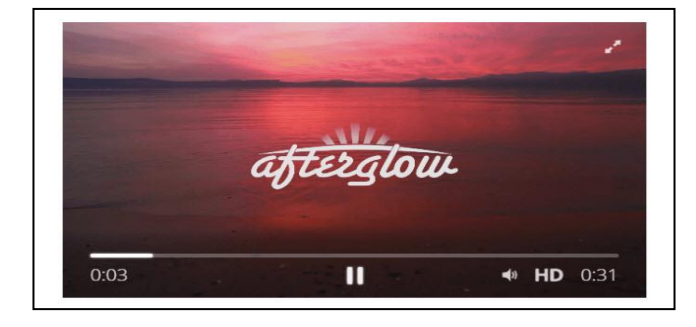
Figure-6 Output Of Video Tag