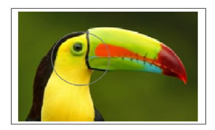
Figure-3. SVG image before zoom

Vector based graphics is defined by the SVG. Even after the compression and enlargement of image the quality of the image will not be lost. The images of SVG can be scalable as well as searched, scripted, indexed and compressed.