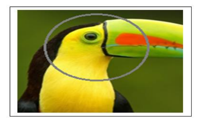
Figure-4 SVG image after zoom