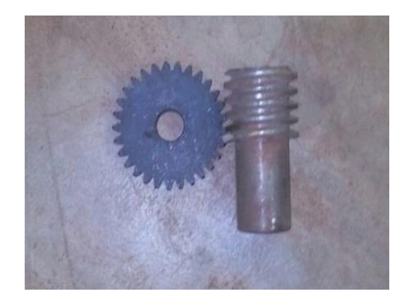
Fig.2 Worm and Worm Gear

Worm gears are used when large gear reductions are needed. It is common for worm gears to have reductions of 20:1, and even up to 300:1 or greater. Many worm gears have an interesting property that no other gear set has: the worm can easily turn the gear, but the gear cannot turn the worm. This is because the angle on the worm is so shallow that when the gear tries to spin it, the friction between the gear and the worm holds the worm in place.