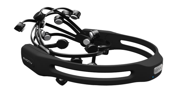
Fig -3: EMOTIV Headset [4]

EMOTIV EPOC+ as shown in fig.3 is a wireless headset. It has 14 saline sensors that offer optimal arrangement and collection of signals with effective strength [4].