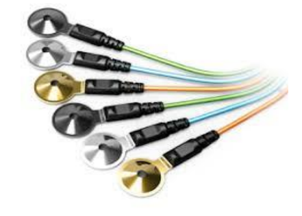
Fig -2: Reusable EEG Electrodes [2]

They need to be cleaned carefully after every use. Their initial cost is higher than the disposable electrodes, however this tends to even out over time as they are durable and have an impressive lifetime.