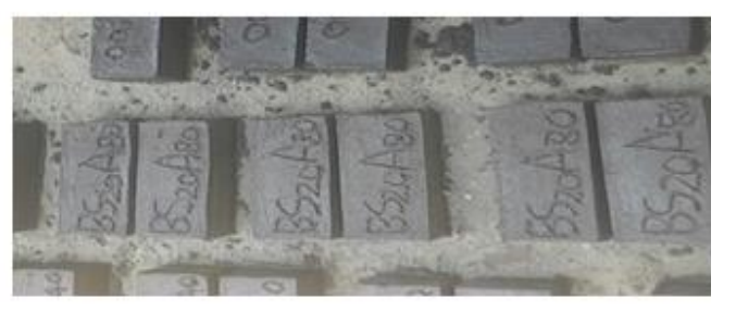
Fig - 2: Brick Specimen BS<sub>80</sub> A<sub>20</sub>