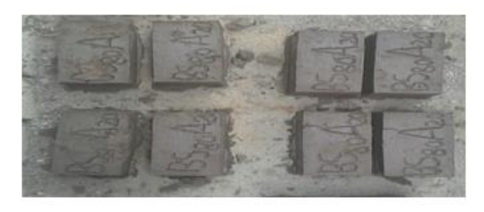
Fig - 5: Brick Specimen BS<sub>20</sub> A 80