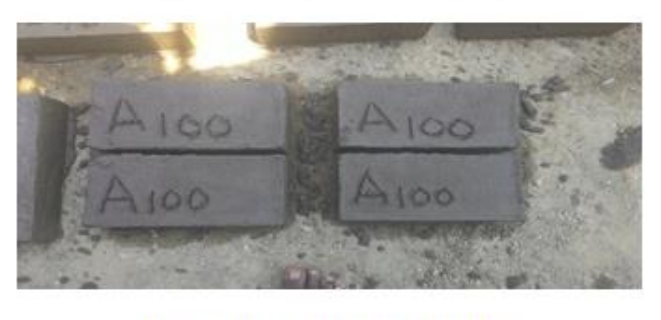
Fig - 6: Brick Specimen BS<sub>0</sub> A<sub>100</sub>