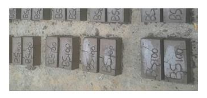
Fig - 1: Brick Specimen BS100 A0