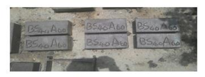
Fig - 3: Brick Specimen BS<sub>60</sub> A<sub>40</sub>