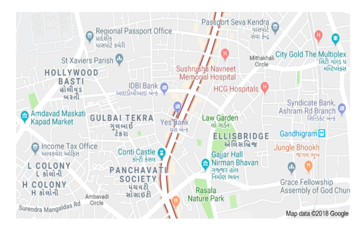
Figure 2 study area (C G Road)

Chimanlal Girdharlal Road as a study Area, colloquially the C. G. Road, is one of the major roads of Ahmedabad. It has been ranked as the costliest retail location in the city. It is named after Chimanlal Girdharlal, one of the major businessmen of the 1960s in India.