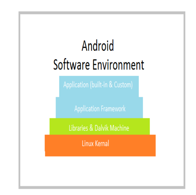
Fig. 1: Android Software Environment

Android is an operating system developed for smartphones and tablets. It is based on Linux kernel and uses Dalvik Virtual Machine (DVM) for executing Java byte code [1]. Absence of GNU C Library and some functions differentiate it from being Pure Linux. Android's source code is released by Google under open source licenses.