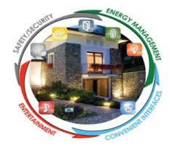
Fig. 1 Internet of Things

Wi-Fi E Switch is a web based system using Raspberry pi. As it has lot of GPIO ports which can be programmed and they provides user control over various things from smartphone like energy saving, security, smart system, surveillance, access control and entertainment [1]. The main aim to design a system is to save time and manpower along with maintaining convenience and security. This system is simply design to provide comfort, security and it is easily accessible. Internet based Home Automation System is very convenient, easy flexible and cheap [2]. Many devices now have Wi-Fi and can connect to Smartphones or home computers. But these devices cannot communicate with each other or else need additional devices to do so. Thus, these devices need to be unified, such that they can be monitored and controlled using one single program or device, e.g. controlling lights, fans, air-conditioners, oven, refrigerator, TV etc. by using an application on the Smartphone [3].