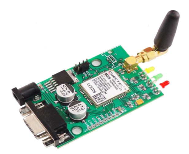
Fig-1: GSM Module

operate on GSM networks. It is also highly economic and less expensive.