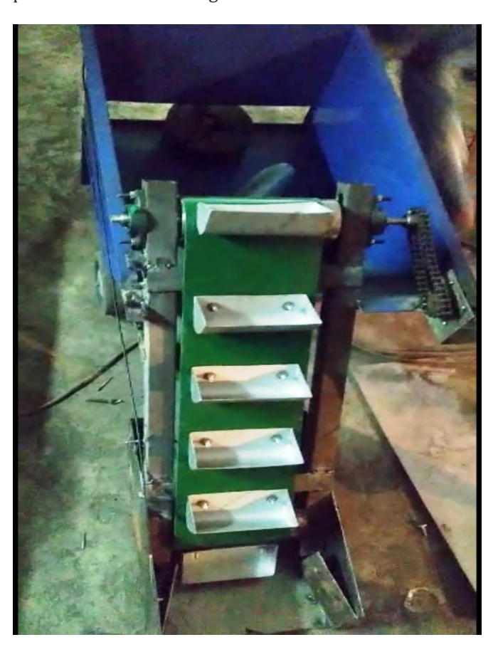
Fig- 3: Our Project Design.

A lever is wired to metallic scoop to lift its front edge to prevent dust from sliding back to the road surface.