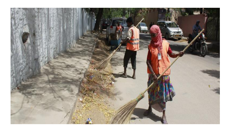
Figure 1:- https://scroll.in/article/730324/hyderabad-sweepers-can-take-the-heat-but-not-the-insensitivity-of-others

According to her she has been suffering from asthma due to dust stewed in the air while brooming the streets, roadsides, payments, corner etc, so she gave the suggestion that if any semi-automated machine could be developed by the government to clean the roads, it will be better to her health as well as other people health also.