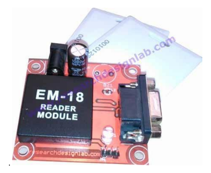
Fig.2: RFID Reader

RFID stands for Radio Frequency Identification. RFID technology is an automated data capture technology that identifies labeled or tagged objects wirelessly. The system consist of RFID Tag and Reader that relays the information on the tag, in the digital form, to a computer system. Reader antennas convert electrical currents into electromagnetic waves that are then radiated into space where they can be received by a tag antenna and converted back to electrical current. Just like tag antenna there is a large variety of reader antennas and optimal antenna selection varies per the solution's specific application and environment. Two most common antenna types are linear polarized and circular polarized.