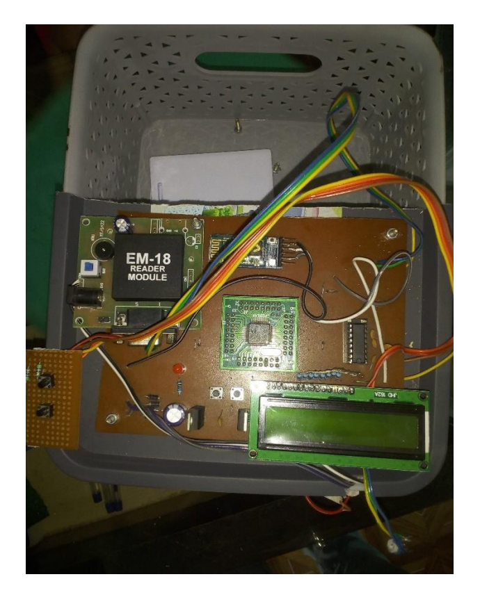
Fig. 3 Project system