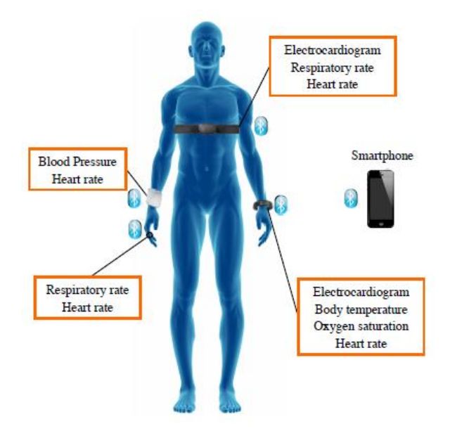
Fig-1:Continuous authentication using different wearable medical sensors

The implementation of continuous authentication using different wearable sensors can be performed as follows. The working block diagram of continuous authentication using wearable medical sensors is as shown in the figure 2.