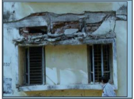
Detoriation Of Building Due To Ageing