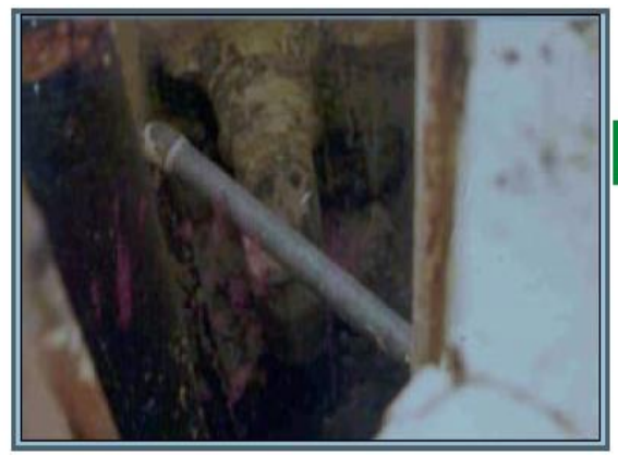
Damage Due To Leakage In The Building