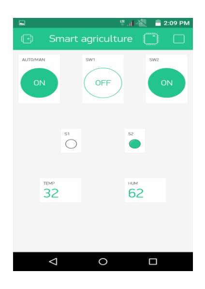
Fig: 7 Screen Shot of blinky mobile app

As shown in the below figure 7 we have two modes in this system, automatic and manual. In automatic the motor can control automatically based on sensor data. In manual mode we can control the motors.