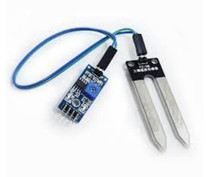
Fig:4 Moisture Sensor

Solenoid valve: A solenoid valve is an electromechanically operated valve. The valve is controlled by an electric current through a solenoid: in the case of a two-port valve the flow is switched on Multiple solenoid valves can be placed together on a manifold. Solenoid valves are the most frequently used control elements in fluidics. Their tasks are to shut off, release, distribute or mix fluids. They are found in many application areas. Solenoids offer fast and safe switching, high reliability, long service life, good medium compatibility of the materials used, low control power and compact design. Besides the plunger-type actuator which is used most frequently, pivoted-armature actuators and rocker actuators are also used.