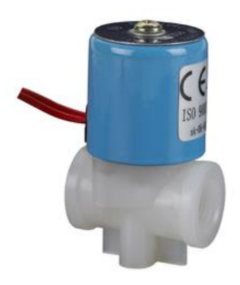
Fig:5 Solenoid valve

Operation: There are many valve design variations. Ordinary valves can have many ports and fluid paths. A 2-way valve, for example, has 2 ports; if the valve is open, then the two ports are connected and fluid may flow between the ports; if the valve is closed, then ports are isolated. If the valve is open when the solenoid is not energized, then the valve is closed when the solenoid is not energized, then the valve is closed when the solenoid is not energized, then the valve is termed normally closed. There are also 3-way and more complicated designs. A 3-way valve has 3 ports; it connects one port to either of the two other ports typically a supply port and an exhaust.