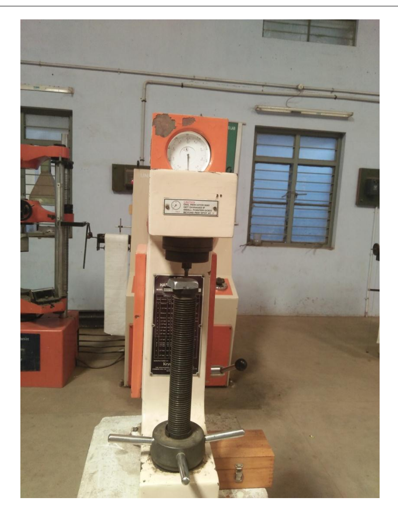
Figure 2: Rockwell hardness testing apparatus