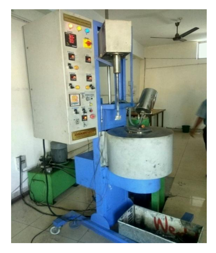
Figure 1: Aluminium stir casting setup

carried at 650rpm about 50 seconds until interface between the particle and the matrix promoted wetting and the particles were uniformly dispersed. Melt formed was solidified in a permanent mould to obtain the flat plate samples. The different compositions were cast as mentioned above by stir casting method. The Stir casting setup is shown in the figure 1