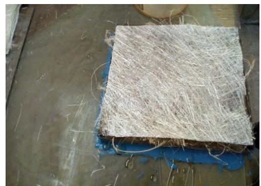
Fig.6 Layers of fibers