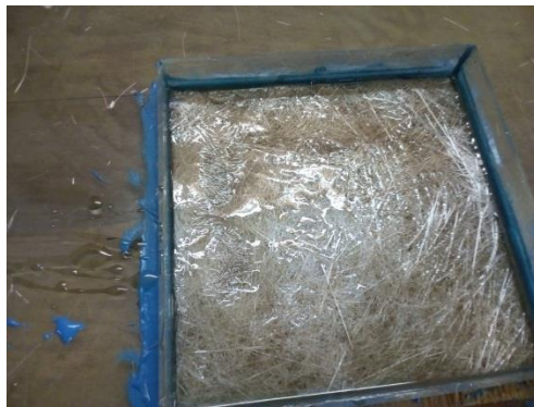
Fig. 3 Glass fiber