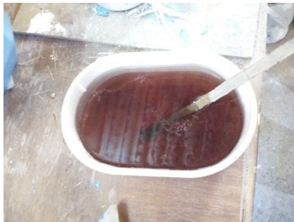
Fig 2 Resin with Hardener