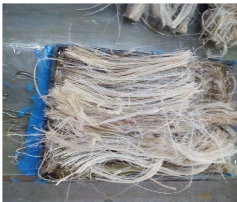
Fig. 4 Natural fiber