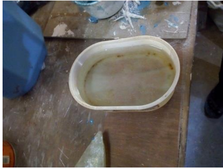
Fig 1 Resin