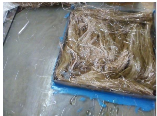
Fig.5 Natural fiber with resin