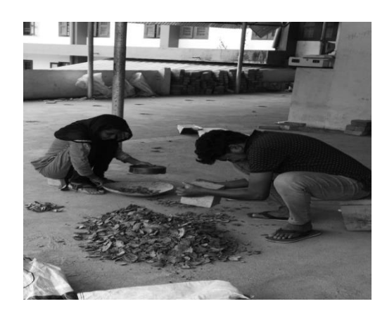
Fig -2: Cross section of coconut shell concrete

Fig -1: Breaking of Coconut shell into smaller pieces