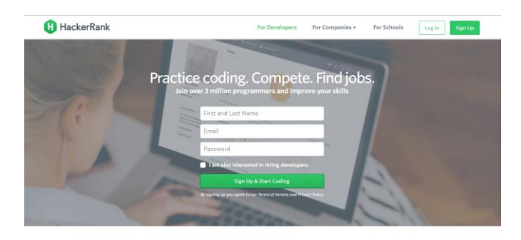
Fig -1: Hacker rank to practice the programming assessment