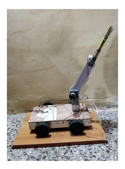
Figure -2 :Structure of Robot

A rectangle metal sheet of size 30 X 20 cm is taken as base of the robot. Four wheels are attached with geared motors to the base. The motors are of 10rpm each to move the bot to accurately detect the garbage. The mechanism of the bot has four which of are placed at an angle of 90 degrees from each other. The arm used to pick the garbage has 2 movements-one movement is vertical which is used to pick the garbage and second is circular movement which rotates the entire arm . For gripper one motor is used to close and open the gripper . Total 3 motor are used for movement of arm.