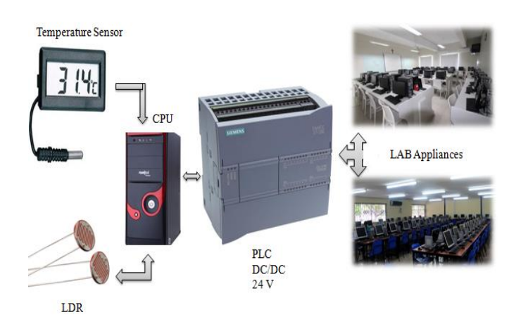
Fig -1: Block Diagram of Proposed Model