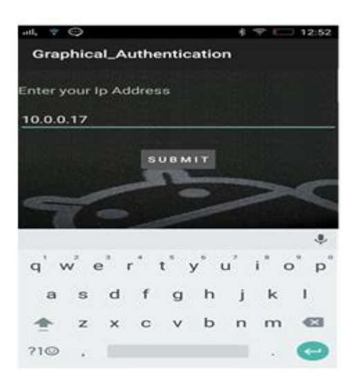
Fig 8.1 CONNECTION