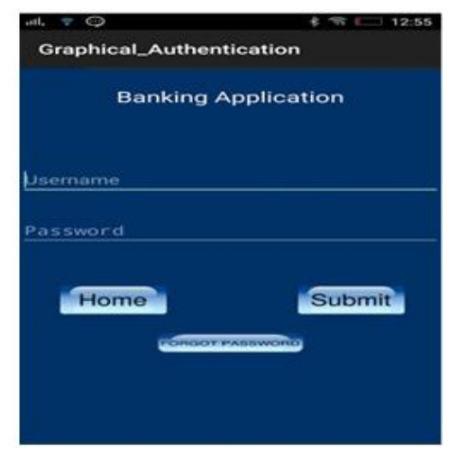
Fig 8.3 Login