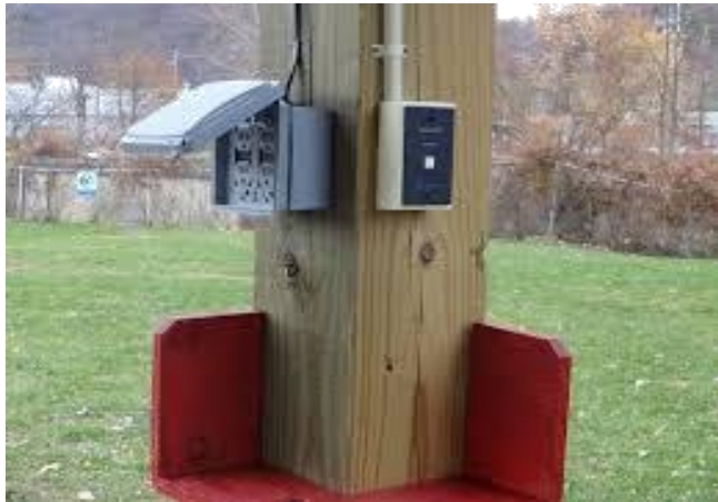
Fig 5. Mobile Charging Setup