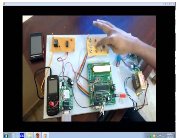
Fig 4. Experimental Setup