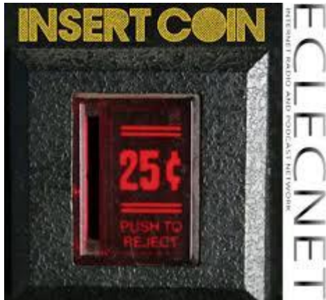
Fig 2. Coin and RFID card inserting setup