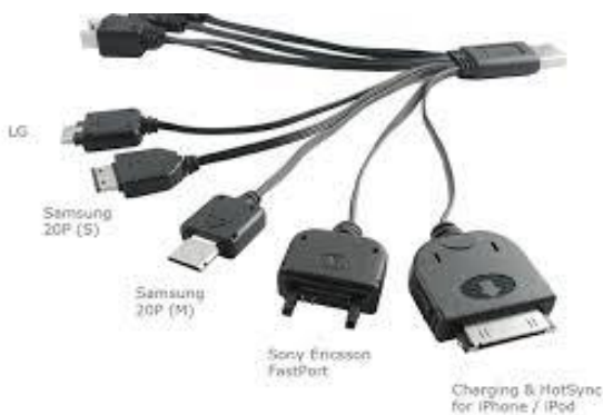
Fig 3. Multi charger Pins Used For Mobiles

Mobile phone chargers are nothing but AC to DC converters using transformer in adopter. They take an input of 220 volt AC and give an output voltage around 5volt DC. Generally the output voltage of the charger is in the range of 5 to 5.5 volts DC.The flow of current in the cell phone for charging is between 1 amp to 2 amp.Multiple charger pin is used according to the cellphone.